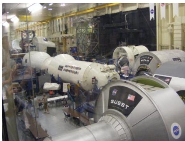
The Space Vehicle Mockup Facility stretches in to the distance as viewed from the viewing corridor. Full size examples of Space station and Shuttle components are assembled here for testing, training and troubleshooting.

Once you do get in the air, if you are looking for an interesting destination that's a bit out of the way (except for you RV guys) The Johnson Space Flight center in Houston has a "behind the scenes" tour, called the "Level 9" that is much more in depth and interesting than the Tram tour. (link to the website on page three).